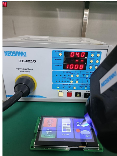
3.1 Electrostatic discharge test

Test process: the product was placed on the test bench to perform contact and air discharge in turn of the serial screen iron frame and display area as shown in Fig.3.1 below. During the experimental process, it was observed whether the screen is dead, black, white, splash, or reboot. According to the experiment results, the performance is in line with the criteria GB/T 17626.2 B level and above.